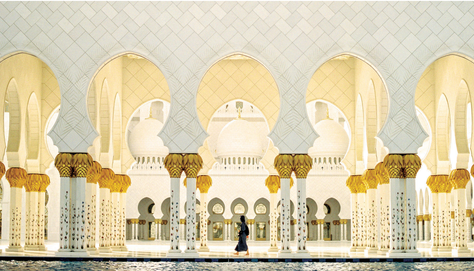
Sheikh Zayed Grand Mosque is located in Abu Dhabi, the capital city of the United Arab Emirates. The largest mosque in the country, it is the key place of worship for daily prayers, Friday gathering and Eid prayers. During Eid it may be visited by more than 41 000 people. The Grand Mosque was constructed between 1996 and 2007. It was designed by Syrian architect Yousef Abdelky. The building complex covers an area of more than 12 hectares, excluding exterior landscaping and vehicle parking.